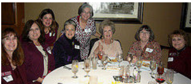
Left: Aggie Moms Table Federation Winter Dinner 2015 Right: