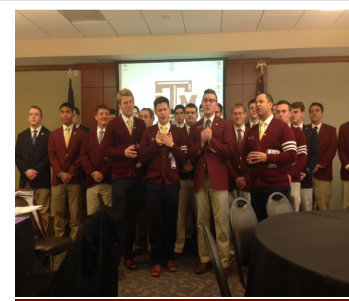
Singing Cadets at District 1&2 Meeting Texas A&M University School of Law January 10, 2015