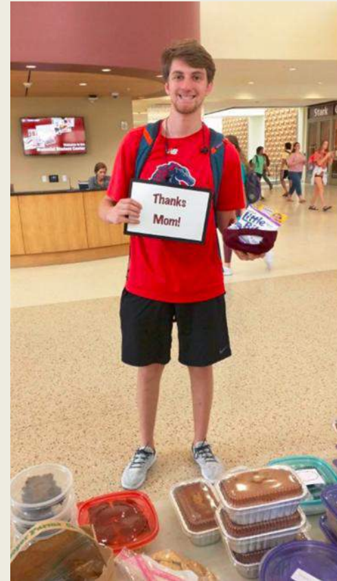
Spring Goody Bags