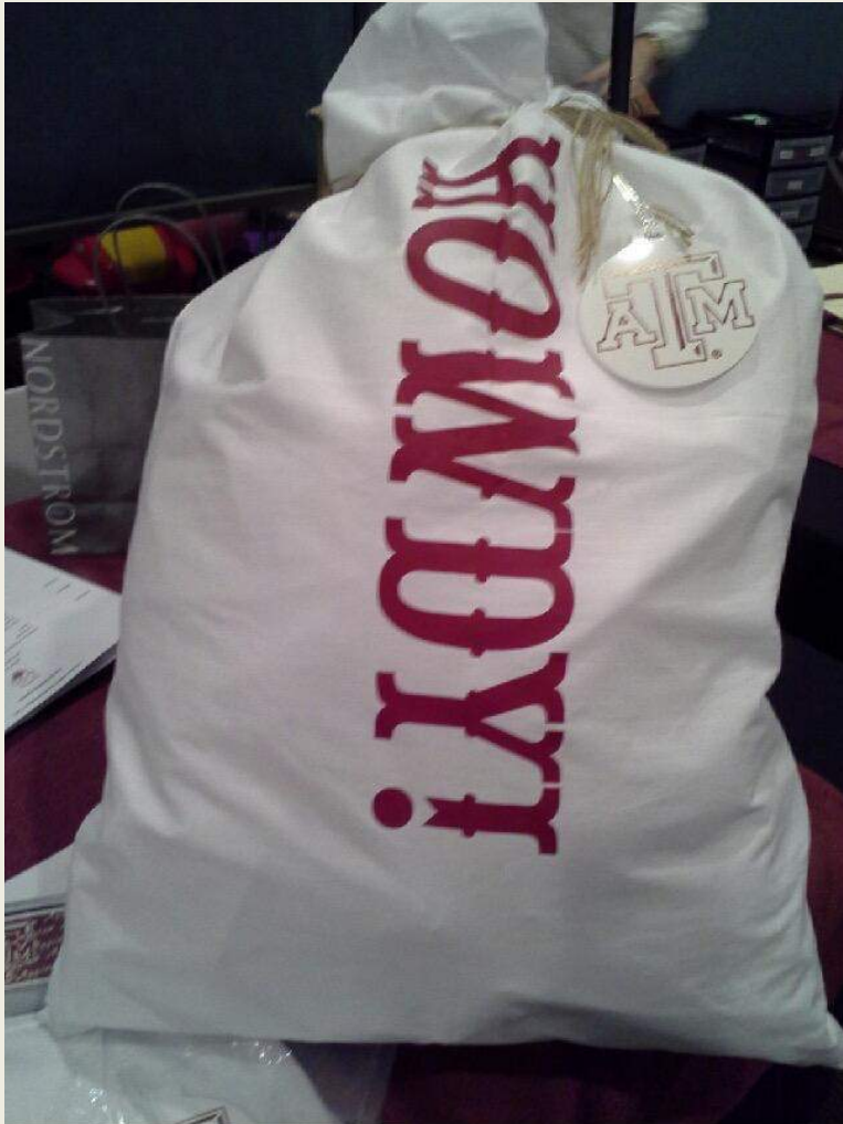
Houston Aggie Moms' Club - Pillowcase with luggage tag