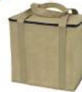
View of Closed Bag (color of bag is tan)