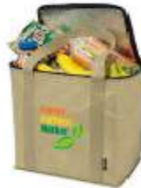
Insulated Grocery Tote (will have an Aggie logo)