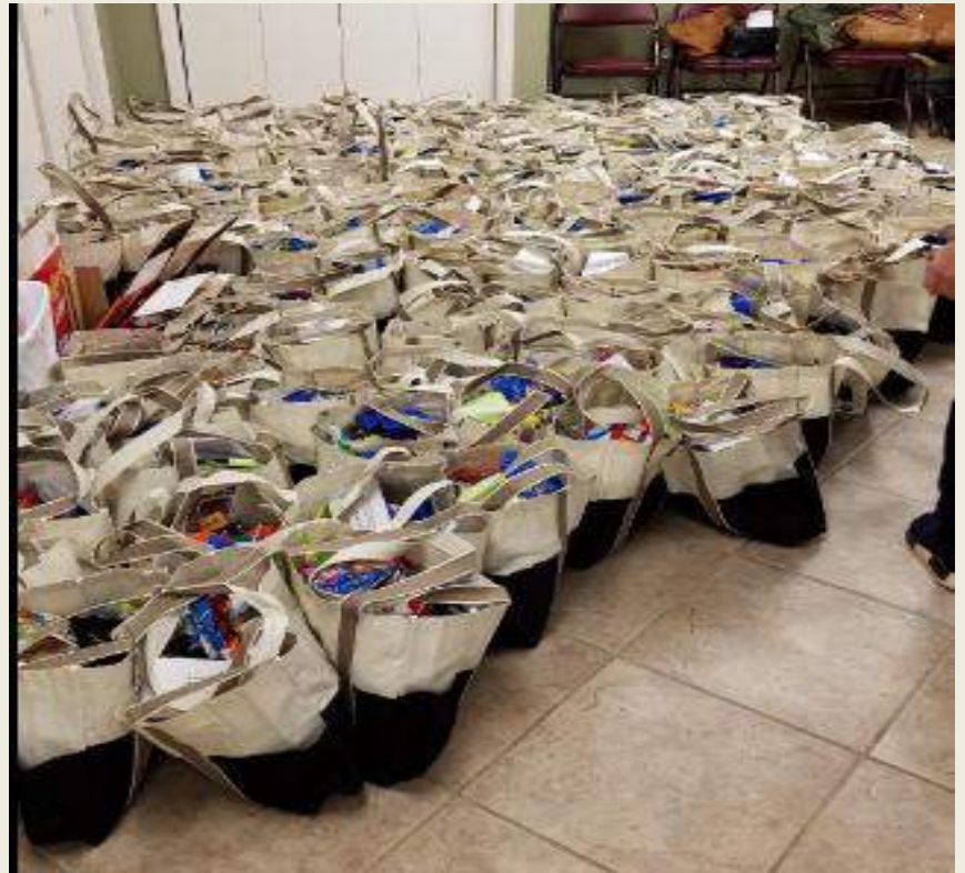
Full Goody Bags ready for distribution