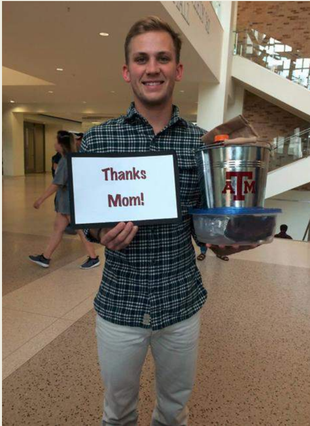
Fall Goody Bags