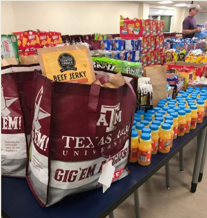
Assembly Line tables